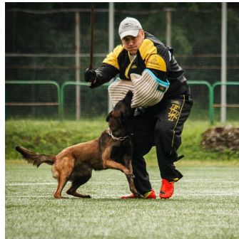
????????? ?????????? ??? ??????????????

?? ?????????? ?????????? ??????, ??? ? ?????????? ?????????????? ? ?????? "????? ??????????"!